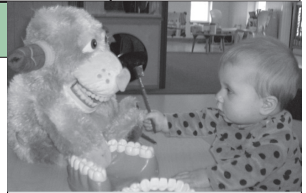
CFO infant exploring dental health at Ellsworth ECEC—2010.