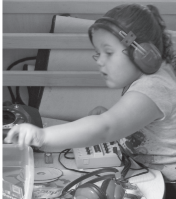
Above: Listening and learning at Ellsworth ECEC 2011.

To ensure our programs meet quality standards, CFO participates Maine's quality rating system, Quality for ME. Quality for ME increases awareness of the basic standards of early care and education, recognizes and supports providers who are providing care above and beyond those standards, and educates the community of the benefits of quality care. All CFO center-based programs participating in the Quality for ME system are rated at Step 4, the highest rating. In addition, CFO provides education and support for all Washington and Hancock County providers through Child Care Opportunities Resource Development Center.